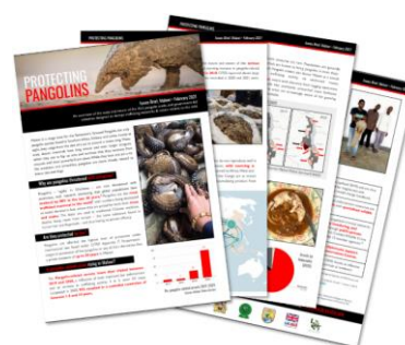
Figure 3: Copies of the briefing paper

A brief paper for pangolin was designed to provide summary of the illegal wildlife trade of pangolins in Malawi. The paper was disseminated to 25 journalists. The main goal of this paper was for media and stakeholders so that they can transfer information. The paper can be downloaded from the following link: https://www.lilongwewildlife.org/reports/