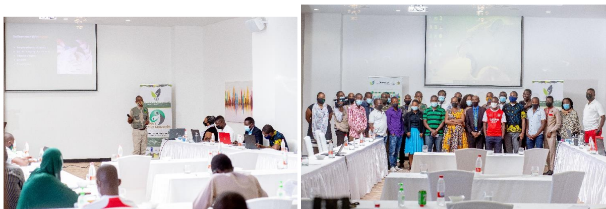
Figure 5: participants in the conference room (L), and a group photo (R)

In partnership with Department of National Parks and Wildlife and Association of Environmental Journalists 2 , a media training workshop for Pangolin Welfare was conducted to provide expert knowledge of pangolin and their illegal trade to media personnel that cover conservational stories. The meeting covered all angles of the pangolin, including details of the various species to how the trade grew internationally and nationally. The meeting then opened the floor to questions which attracted participant’s interest in the various aspects of pangolins including what challenges Malawi is facing in protecting pangolins, the vet process they have to go through after being rescued and the survival rate of