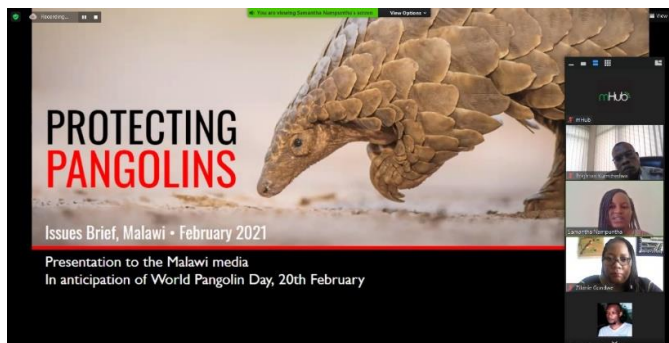
Figure 4: A snippet of the zoom platform during the press briefing

The project initiated, facilitated and participated in the first ever commemoration of the World Pangolin Day which fall on 20 th February every year. Ahead of the commemoration day, zoom press briefing was held on Tuesday 16 th February